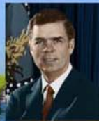
John Block 1981-1986