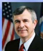
Mike Johanns 2005-2008