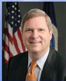
Tom Vilsack Secretary of Agriculture Keynote Address

February 23-24, 2012 Crystal Gateway Marriott Hotel • Arlington, Virginia