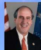
Dan Glickman 1995-2001