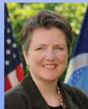
Kathleen Merrigan Deputy Secretary of Agriculture Welcome