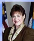
Ann M. Veneman 2001-2005