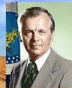
Robert Bergland 1977-1981