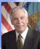
Ed Schafer 2008-2009

Panelists: Former Secretaries of Agriculture