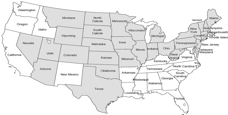
Figure 3: States offering LGM-Dairy (2008)

Pennsylvania, Rhode Island, South Dakota, Texas, Utah, Vermont, West Virginia, Wisconsin, and Wyoming (See Figure 3).